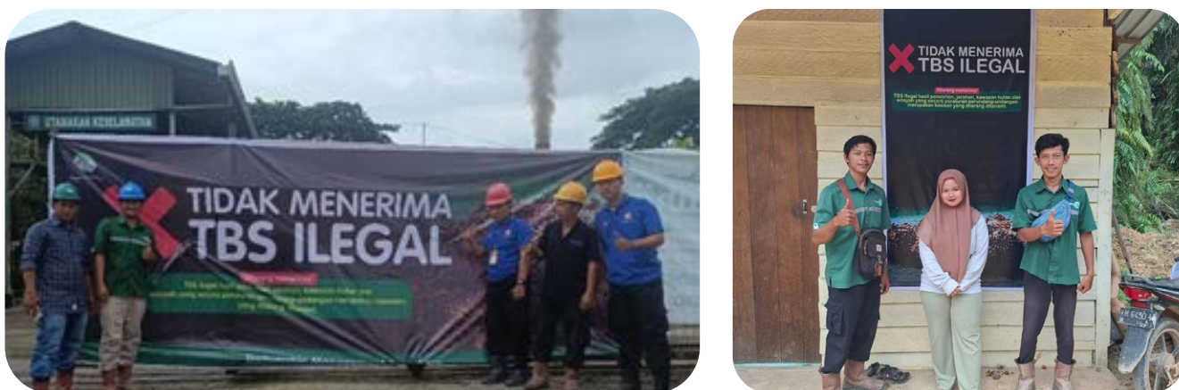
Installation of banners prohibiting the acceptance of illegal FFBs at mills and partner offices

In addition to training effort, we further strengthened the alignment with our Sustainability Policy through multiple reinforcement measures. We maintained our established practice of incorporating sustainability requirements into all FFB supply contracts while conducting regular engagements to remind supplying partners of the prohibition against sourcing from illegal or protected areas. To enhance visibility of these policies, we installed clear warning banners at strategic locations, including palm oil mill entry gates, partner offices, and key loading stations.