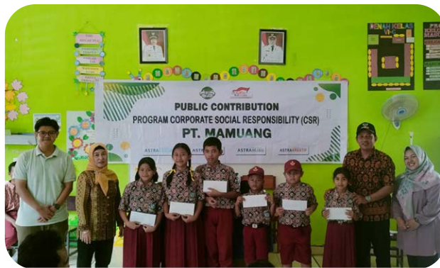
Scholarship provision in villages assisted by PT MMG