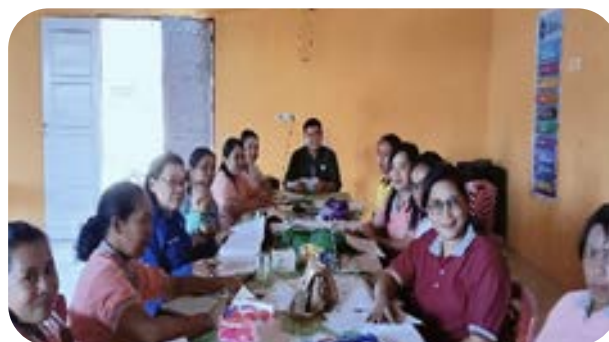
Molino Village Magasi Sinergi MSME assistance