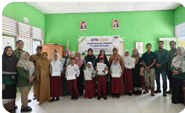
Teacher incentive and scholarship assistance in Towiora village