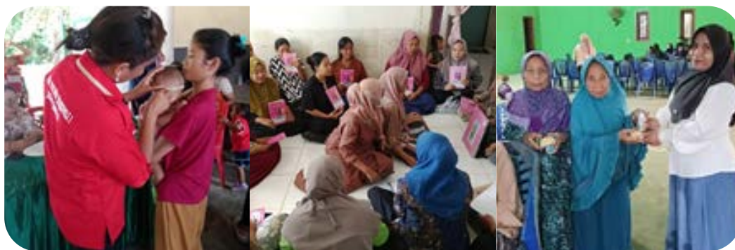
Posyandu and PMT assistance