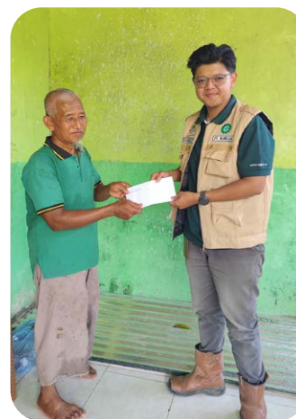
Infrastructure assistance for Islamic Boarding Schools