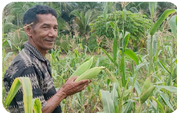
Sweet corn harvesting in Suluh Rimbo Air Panas