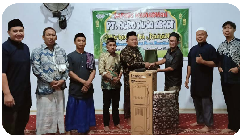
PT ANA provided prayer essentials and facility support to its partner villages

In welcoming the holy month of Ramadan, and in response to community requests to enhance existing worship facilities, PT ANA provided infrastructure support to mosques and prayer halls (mushola) across its seven partner villages: Bunta, Tompira, Bungintimbe, Towara, Molino, Pebooa, and Towara Pantai. This initiative aimed to foster interfaith harmony and help communities better prepare for the spiritually meaningful month. As part of this support, PT ANA distributed dispenser units, prayer carpets, sarongs, and sound system equipment to seven partner mosques.