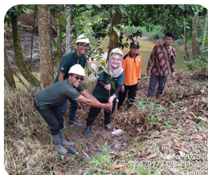
Tree planting with SMPN 4 Pangkalan Banteng (top), with SDS GSDI-GSYM (left) and with the community of Pandu Sanjaya village (right)