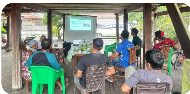
Online training activities