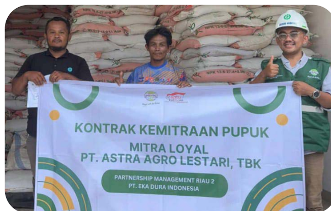
Support program for financing and procurement of oil palm seeds and fertilizer