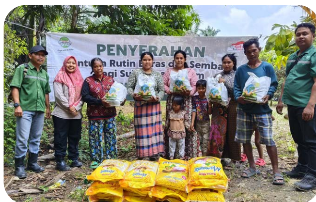
Distribution of staple food to Orang Rimba