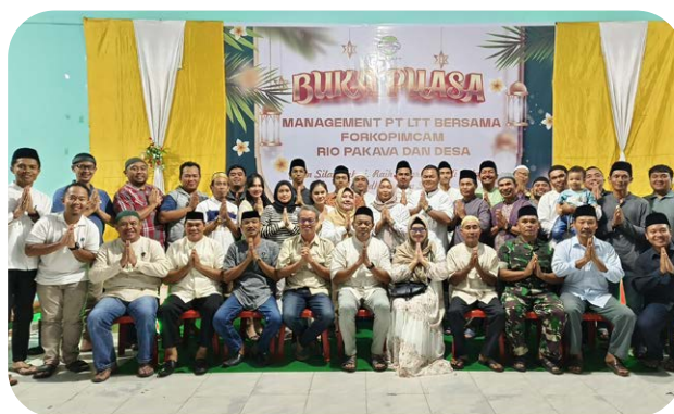
Iftar Activities with Forkompimcam and Ramadan Safari in PT LTT partner villages