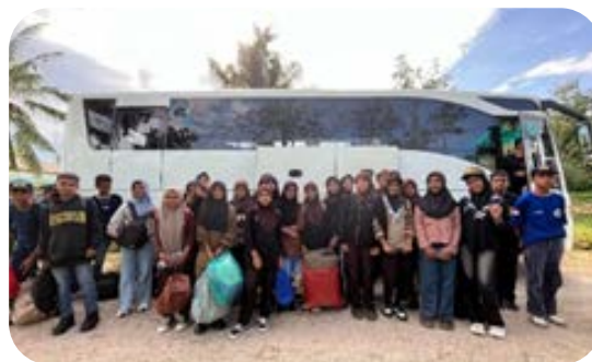
Provision of teacher honorarium incentives and supporting camp activities through school bus rental