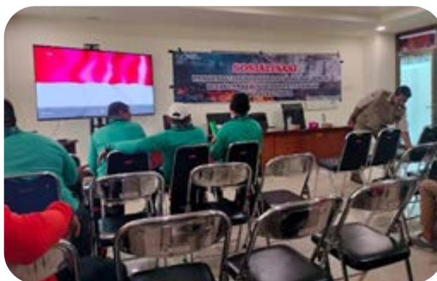
Forest and Land Fire Prevention Awareness with the Plantations and Livestock Office of Paser Regency

Additionally, this quarter, the Company collaborated with village authorities, local police (Kapolsek), military command (Koramil), District Officials, along with farmer groups to prepare for upcoming training, and the formation of new MPA in Central Kalimantan, scheduled for implementation in the next quarter. These efforts reinforce our commitment to community-based fire risk reduction and sustainable land management.