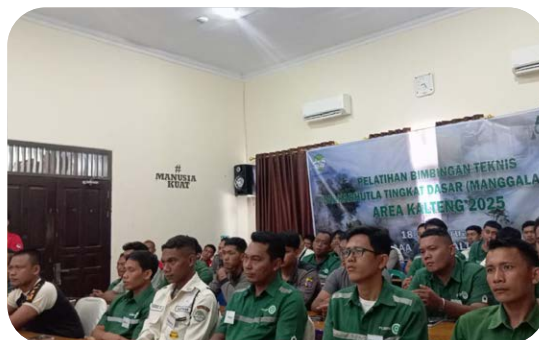
Documentation of Manggala Agni technical guidance