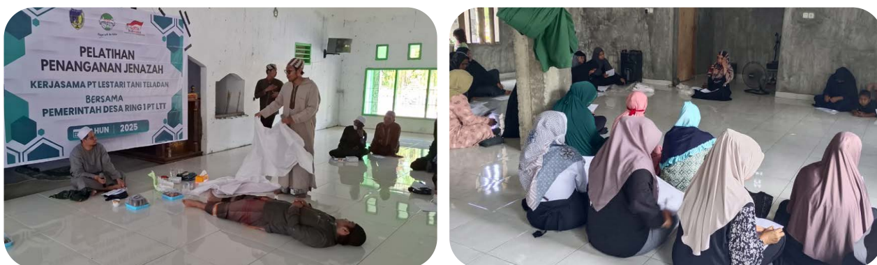
Corpse bathing training activities with the local community and mosque committees

Beyond physical development, PT LTT recently conducted a corpse-handling training session attended by 60 participants, including community members and local mosque administrators. The program, held in collaboration with Daar Azzahra-Palu Islamic Boarding School, aims to enhance community skills in accordance with Islamic funeral rites. This supplementary training underscores PT LTT's commitment to supporting both infrastructure and religious education in Towiora Village as the cemetery project progresses.