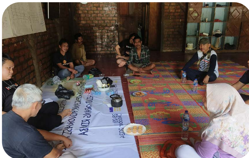
Consultative meeting between the Company and Orang Rimba