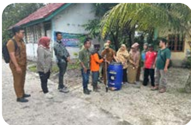
Proklim development by DLH in Riau Province