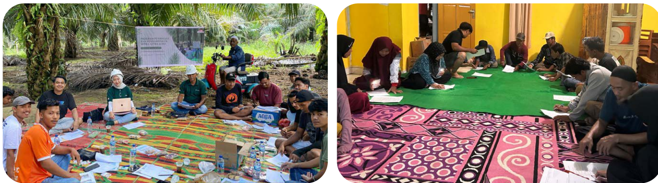
Offline training activities; pre-test and pro-test completion

In addition to training effort, we further strengthened the alignment with our Sustainability Policy through multiple reinforcement measures. We maintained our established practice of incorporating sustainability requirements into all FFB supply contracts while conducting regular engagements to remind supplying partners of the prohibition against sourcing from illegal or protected areas. To enhance visibility of these policies, we installed clear warning banners at strategic locations, including palm oil mill entry gates, partner offices, and key loading stations.