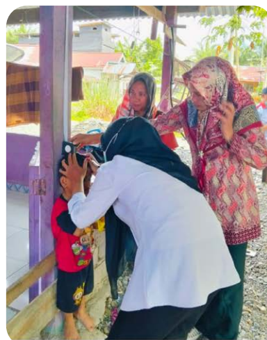
Posyandu activity assistance