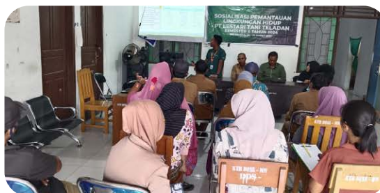
Socialization of environmental observation of PT LTT and assisted villages