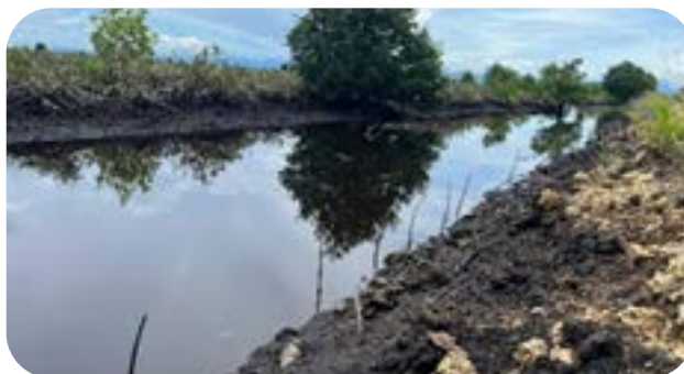
Mangrove planting in Jengeng village