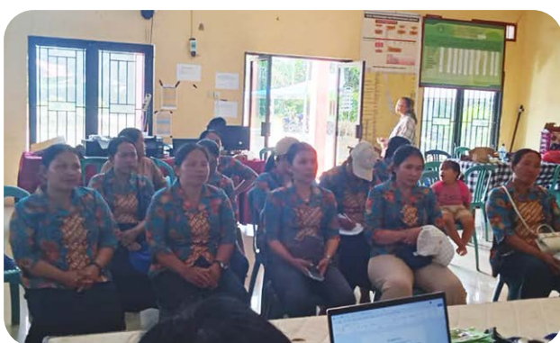
PKK assistance for environment counseling in Martasari Village