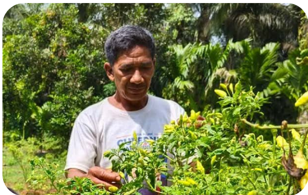
Chili harvesting in Suluh Rimbo Sikar

Meanwhile, Suluh Rimbo Air Panas cultivated lemongrass (citronella) and sweet corn, yielding a harvest of 40 kilograms of sweet corn. This harvest not only supported the community's food needs but also served as a source of additional income, with the produce being sold to both within the community and at the local markets. This success demonstrates how Suluh Rimbo initiatives has contributed to enhancing food security, supporting economic independence, and promoting sustainable agricultural practices that aligned with local wisdom and cultural values.