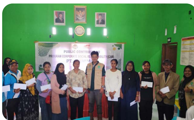
Incentive assistance for posyandu cadres