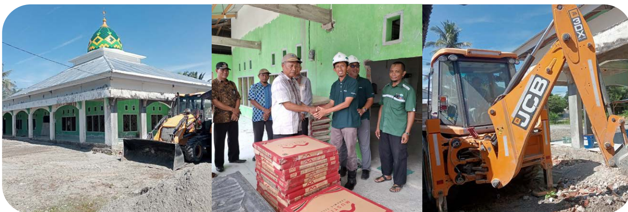
Provision of heavy equipment for grading and ceramic tiles for Towiora village mosque

As of the first quarter, the development of a public cemetery in Towiora Village is advancing, with the process currently in its final administrative phase to formalize the Company's endowment to the community. Alongside the completion of state administration, the construction of perimeter fences and gates has also been completed, and work is ongoing to organize burial plots in a more structured layout. While awaiting for official handover, this cemetery is now ready and available for public use as needed.