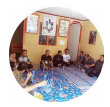
Socialization to Local Community