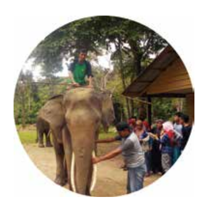
Field Laboratory for Veterinary Medicine Student