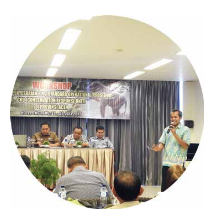
Arrangement of Operational SOP of CRU